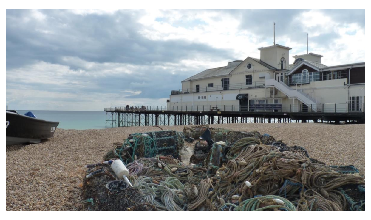
Didn't we have a lovely time, the day we went to .... Bognor!