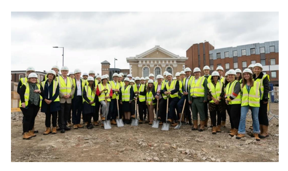
13 October 2022 - work on Unilever's UK and Global Headquarters begins (note KURC in the background).