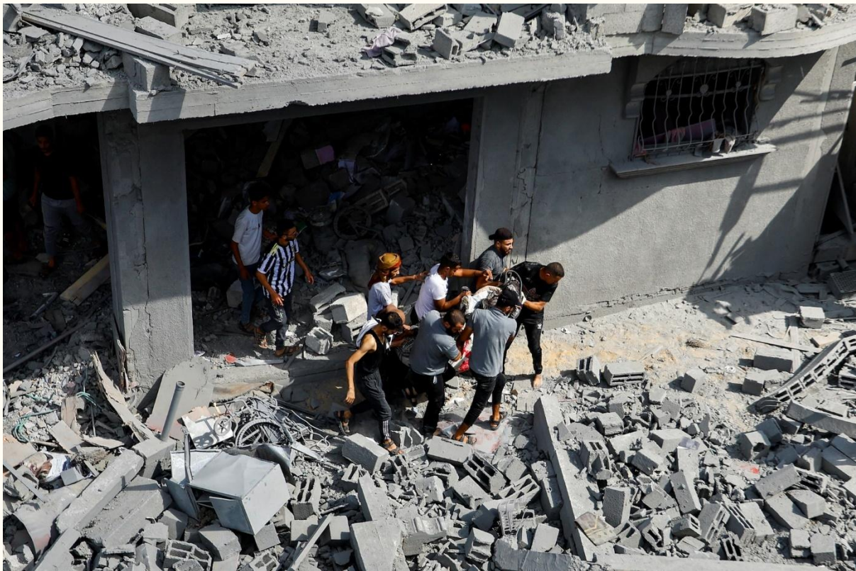
Palestinians carry a casualty following Israeli strikes on houses in Rafah in the southern Gaza Strip, October 17.

“Sign petitions– particularly the one about letting in baby milk.”