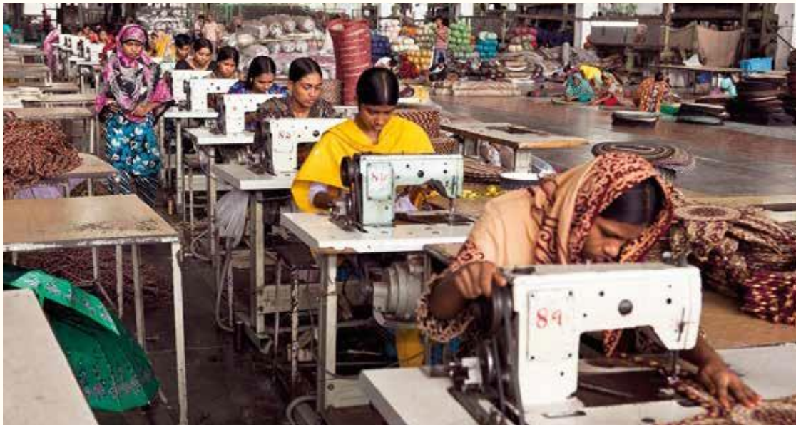
Clothing factory workers, Bangladesh.

Life-giving Faith | Defiant Hope | Generous Love