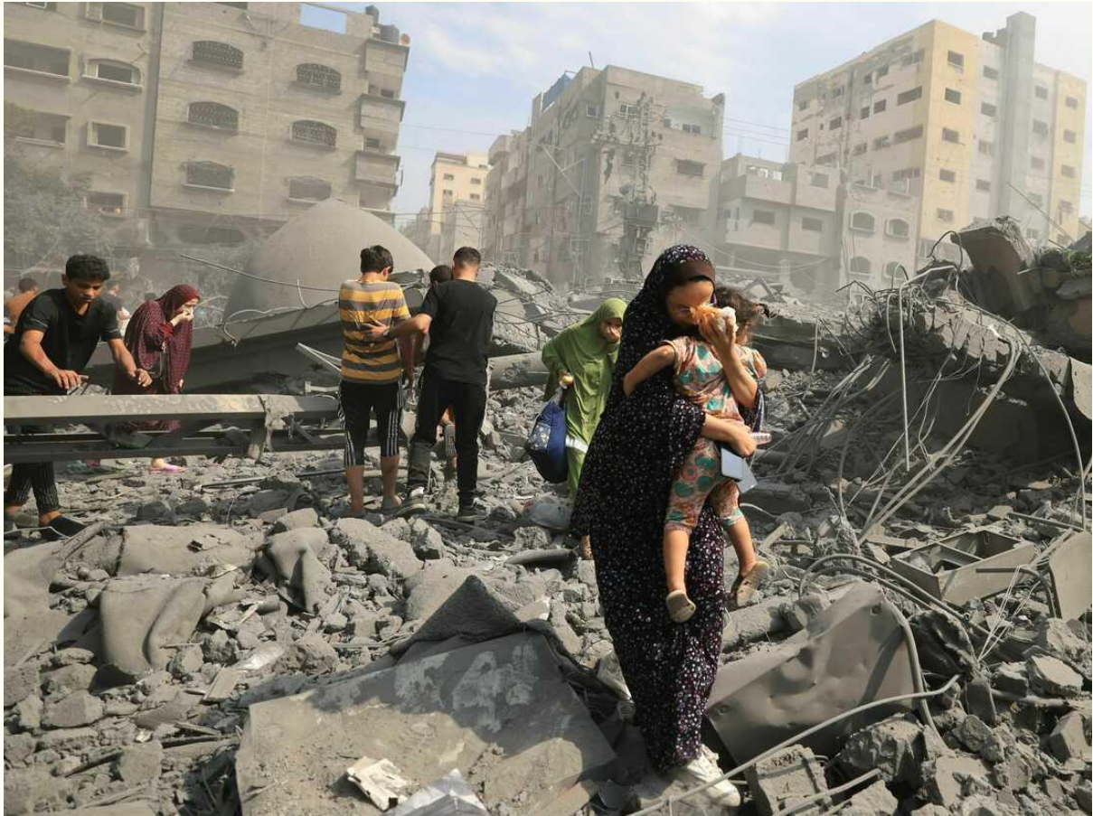
Palestinians evacuate the area following an Israeli airstrike on the Soussi mosque in Gaza City on October 9, 2023. Images of suffering, violence and death in Gaza and Israel have flooded the news since Oct. 7.

Lesley M Charlton Kingston URC July 2025