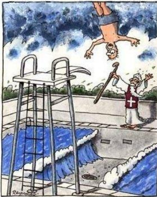
Moses' first and last day as a lifeguard.