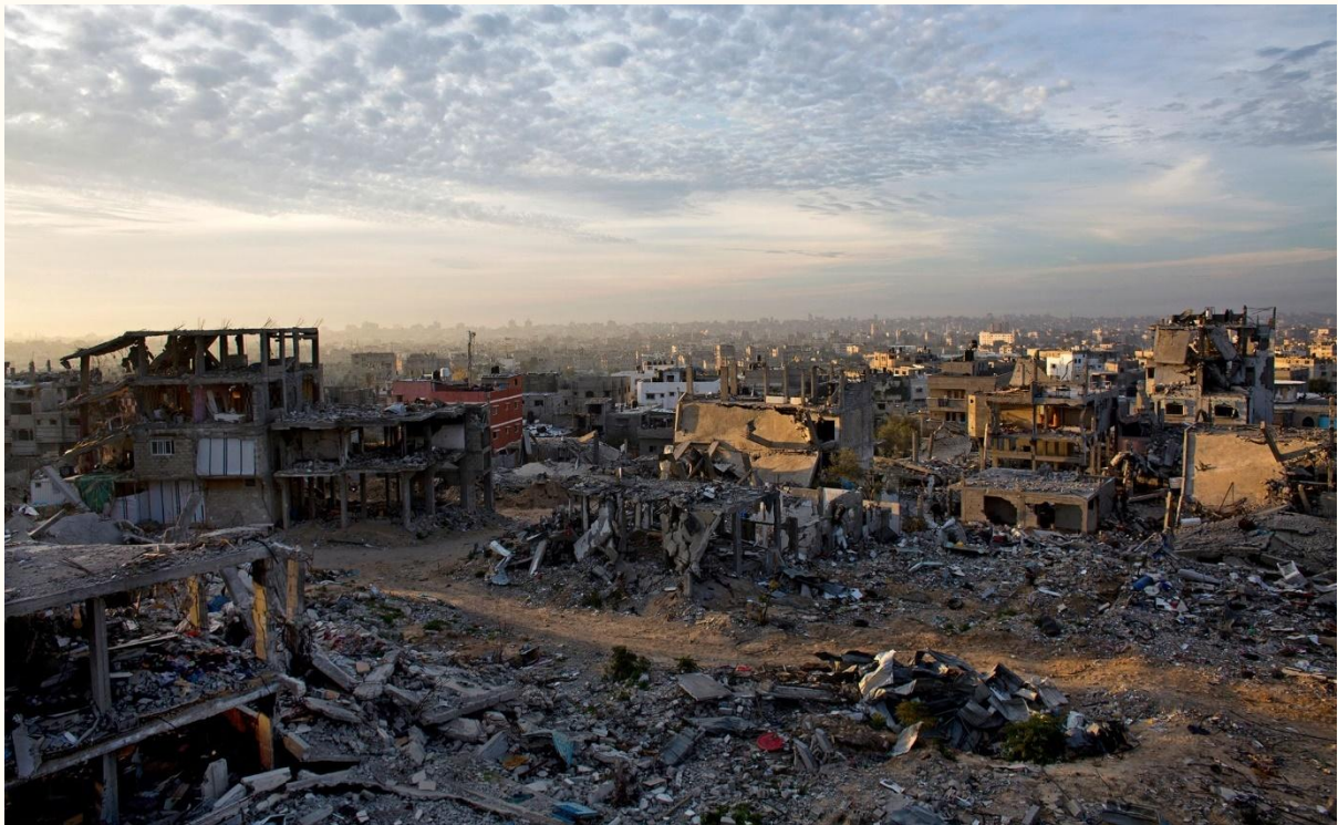
Sundown's fading light shows the destruction in the Sha'af neighborhood of Gaza City after the summer war between Israel and Hamas.

Lord hear us as we pray in the power of your Spirit, through Jesus Christ our Lord. Amen