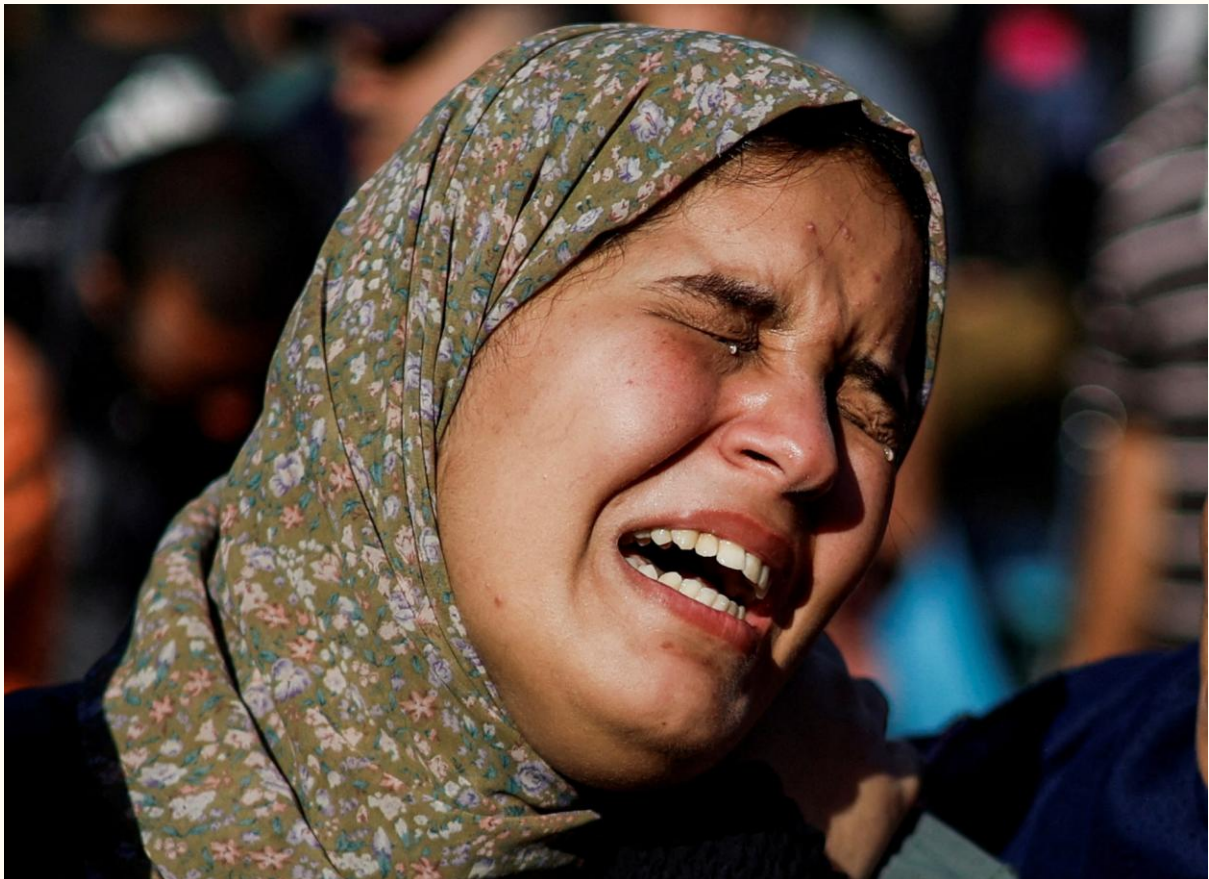
A woman mourns during a funeral for Palestinians killed by Israeli strikes, in Khan Younis in the southern Gaza Strip, October 26.

11. I distinguish between the government and people of Israel. Two thirds of Israelis want the war to end. The President and his supporters do not.