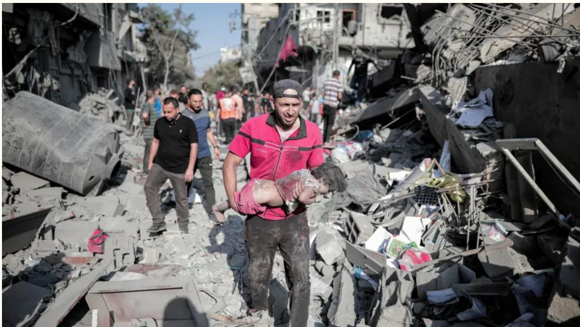
Photo credit to: Al menos 70 muertos en ataque israelí a campo de refugiados de Al Maghazi en Gaza

“I am simply praying a few times a day, especially from TV News.”