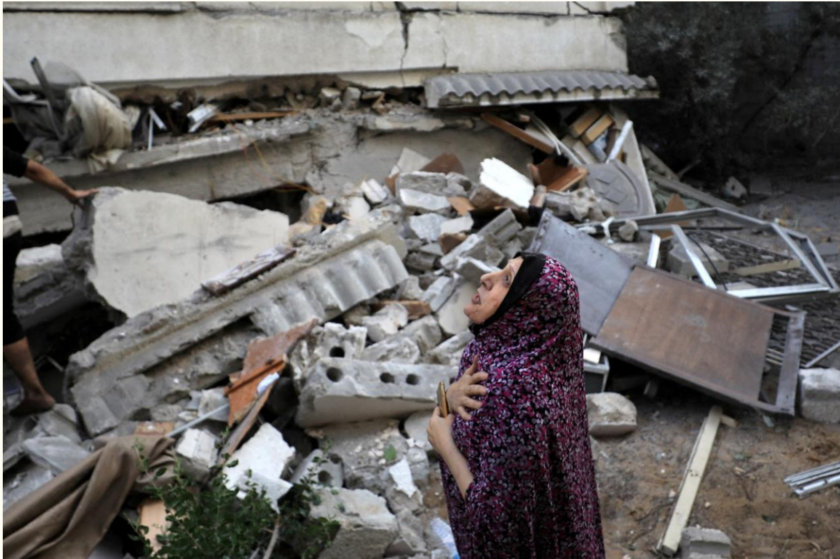
A Palestinian woman reacts at the site of an Israeli strike on a residential building in Gaza City, October 25.

“Give money to the Disaster Emergency Committee.”